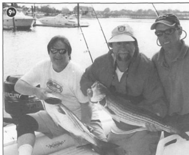
Team Penalty Box finished ninth.