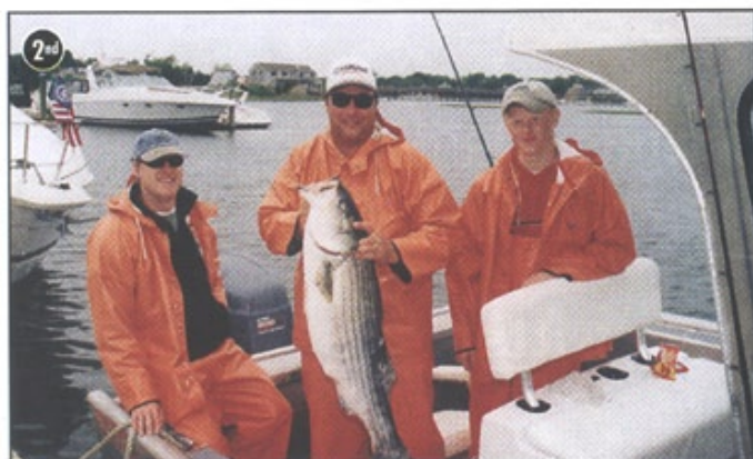
The Silver Bullet with 2nd place bass.