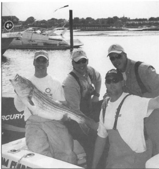
5 For Fighting takes 4th place.

eral already loaded into his plotter. These are just a few of the choices that everyone fishing the ASA Division One opener at the Bass River Marina on Cape Cod had to make.