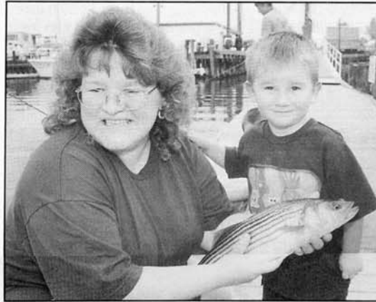
Hewitt's dock was the place to be for Saturday's youth striper tournament. Young anglers beamed with pride over their catches.