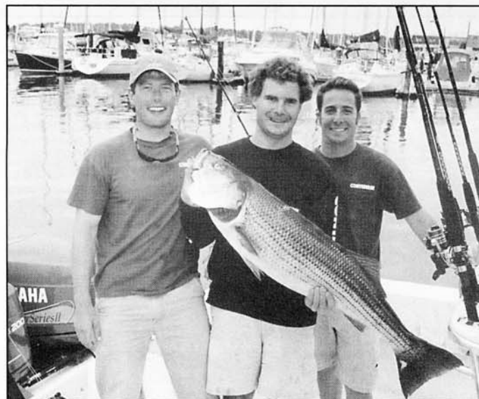
The Trayder crew finished fifth with a nice 29.06.