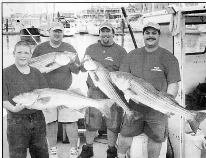
The Ave Maria had a great day fishing.