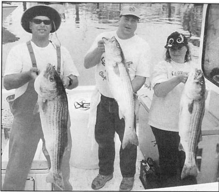
Little Sister with some of the fish caught in Boston Harbor.